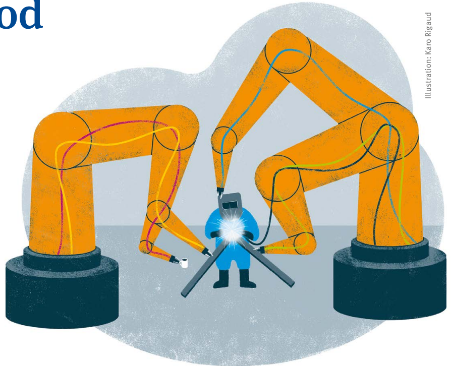
Illustration: Karo Rigaud

How do we want to work in the future? How to structure social security? Digitalisation poses fundamental questions anew – also from the perspective of statutory accident insurance. This is not just about new forms of work and the associated new types of risks for occupational safety and health. It is about basic definitions of ‘work’ and ‘employment’. In the upcoming legislative period, policy makers will have to find answers, including answers on how legislation on occupational diseases should be further developed.